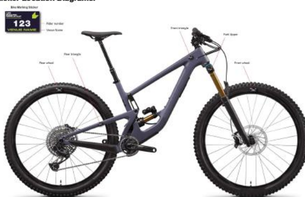
Sticker Location Diagrams:

Following a repair, the racer must return to the Commissaire or Race Director to have the replacement part(s) re-marked (if applicable) before rejoining the race.